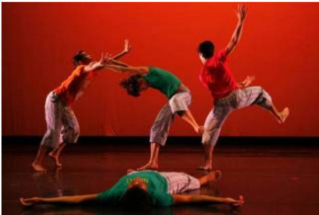
St. John's Wort

Tickets on sale to the public Monday, October 5, 2009