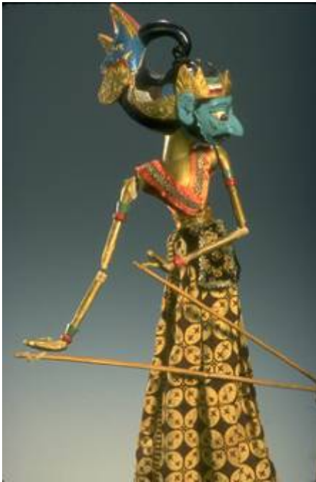
Batara Brama; Indonesia; Wayang Golek; c.1955. Wayang Golek is the only variety of round, wooden puppet found in Indonesia. Its use is confined to the western parts of Java. Gift of Nancy L. Staub. Permanent Collection.

Monday, May 18, 2009 – Putnam County Schools